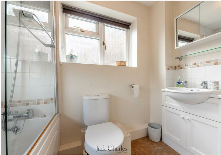
Jack Charles Estate Agents