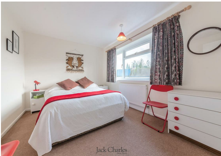
Jack Charles Estate Agents